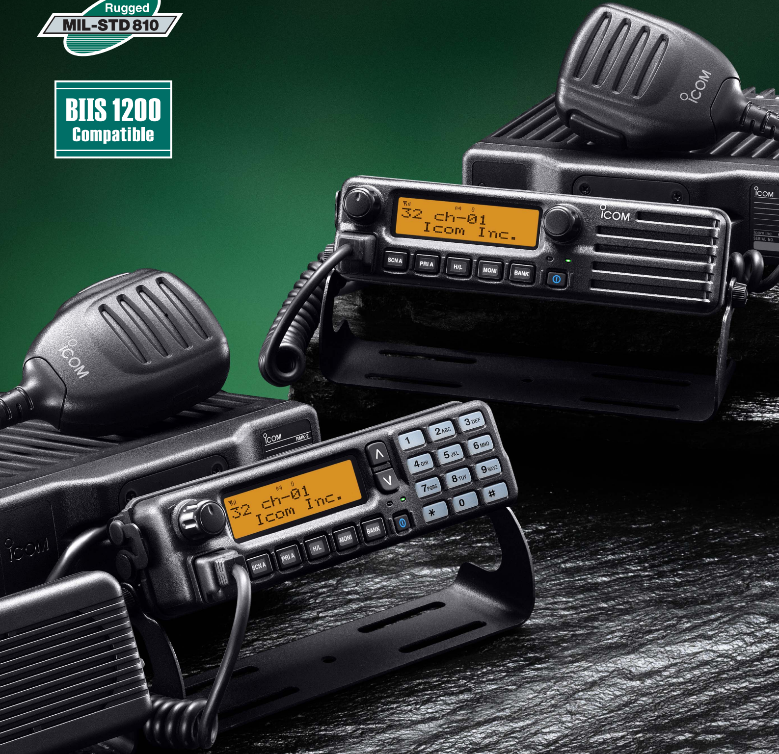
Photo includes optional separation kit, RMK-2 and separation cable, OPC-609.